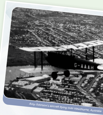
Amy Johnson's aircraft flying over Hawthorne, Australia