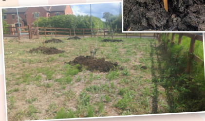
Cllr Gilder pampering the orchard trees with some very well rotted manure