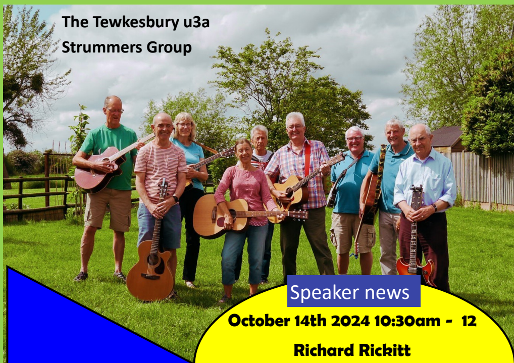
The Tewkesbury u3a Strummers Group

Baptist Church Hall, Station Road, Tewkesbury, GL20 5DR